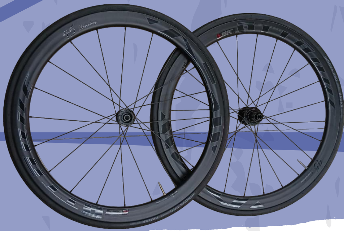
RIM WHEELSET CARBON 45MM ATTAQUE