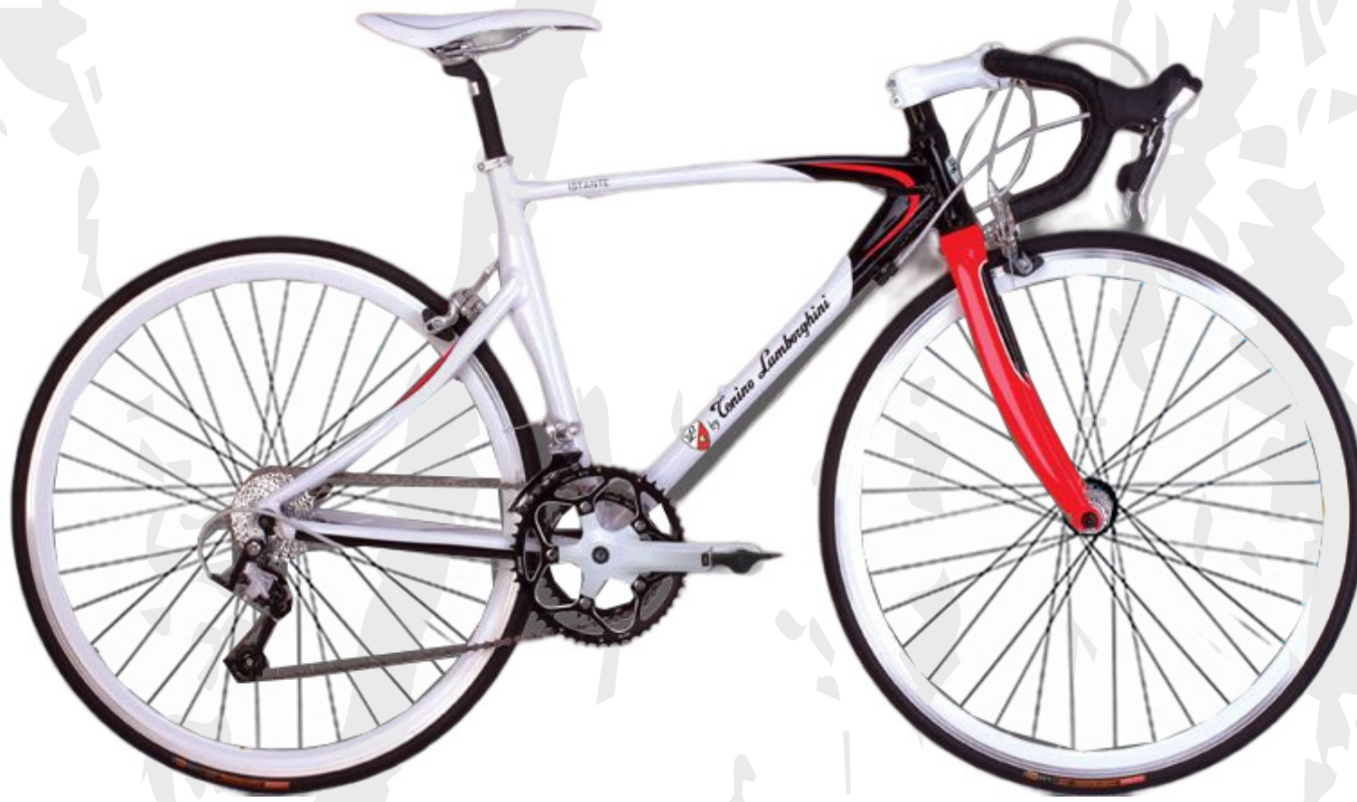
1 MINI ROADBIKE