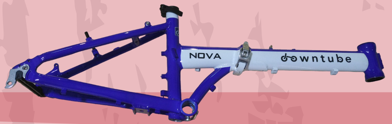
1 FRAME SET DOWNTUBE NOVA