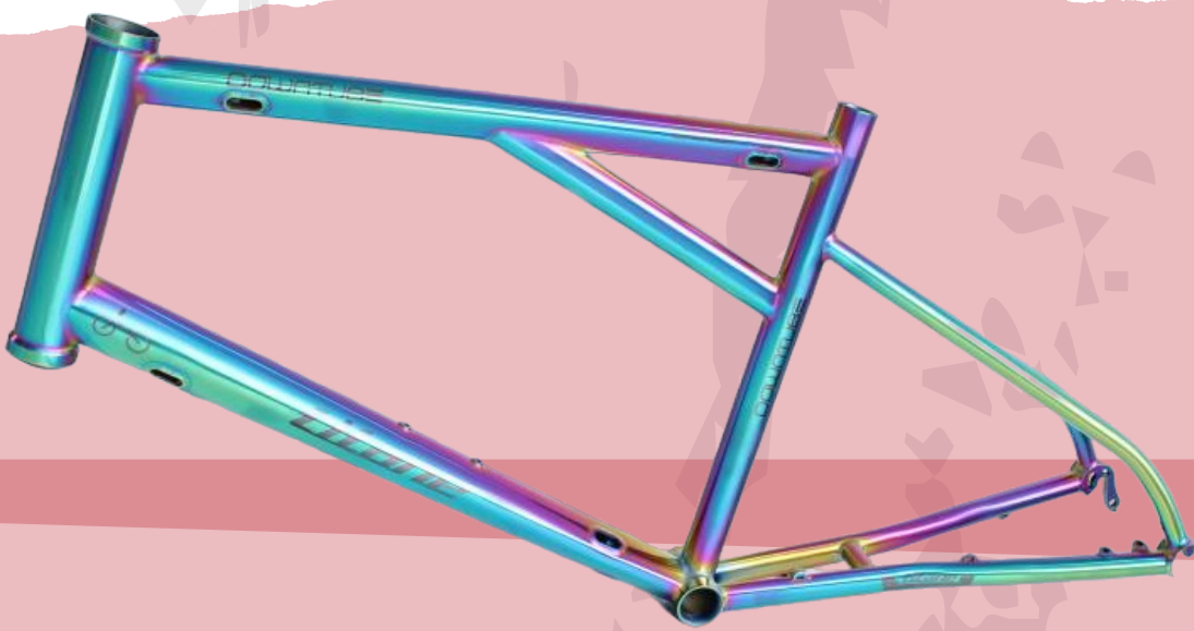
1 FRAME DOWNTUBE TITANE Minivelo Frame Titanium Ti3AL