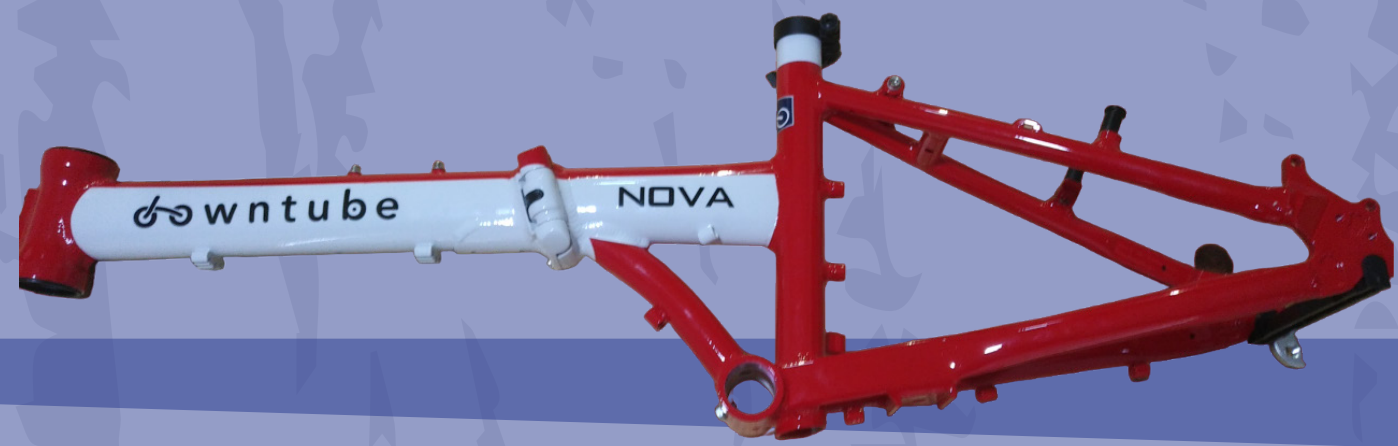
1 FRAME SET DOWNTUBE NOVA