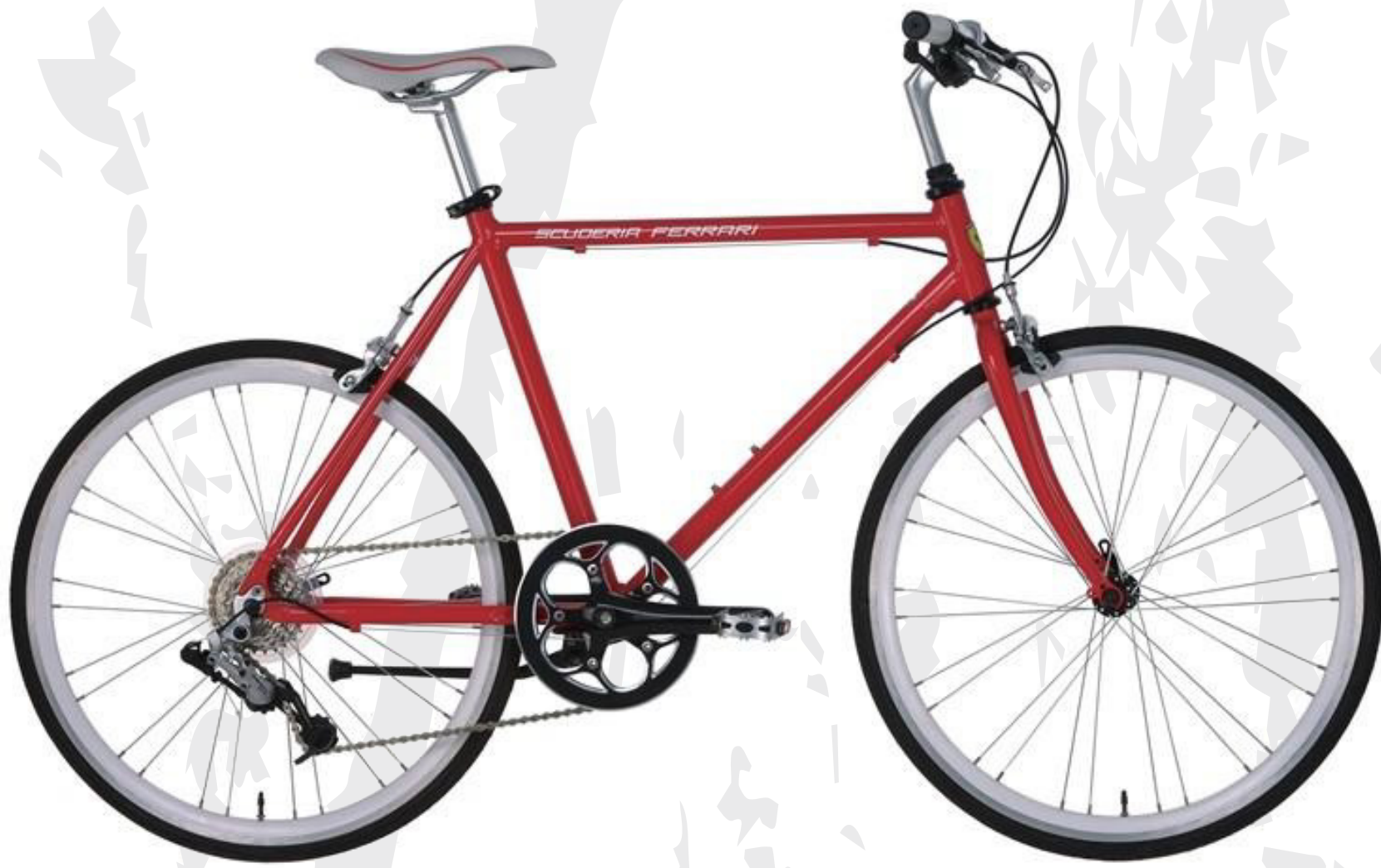
1 URBAN BIKE