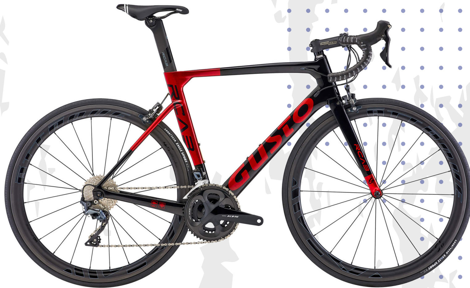
GUSTO RCA3 SPORT ULTRA T1000 TORAY CARBON