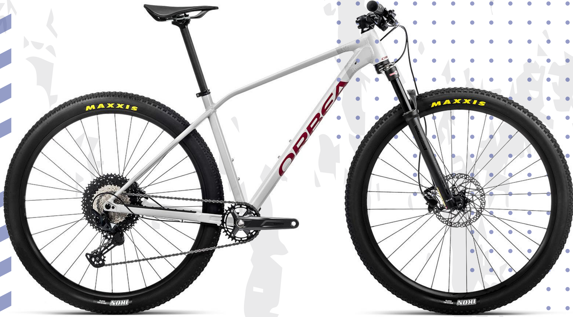
ORBEA Alma XC 29' MTB